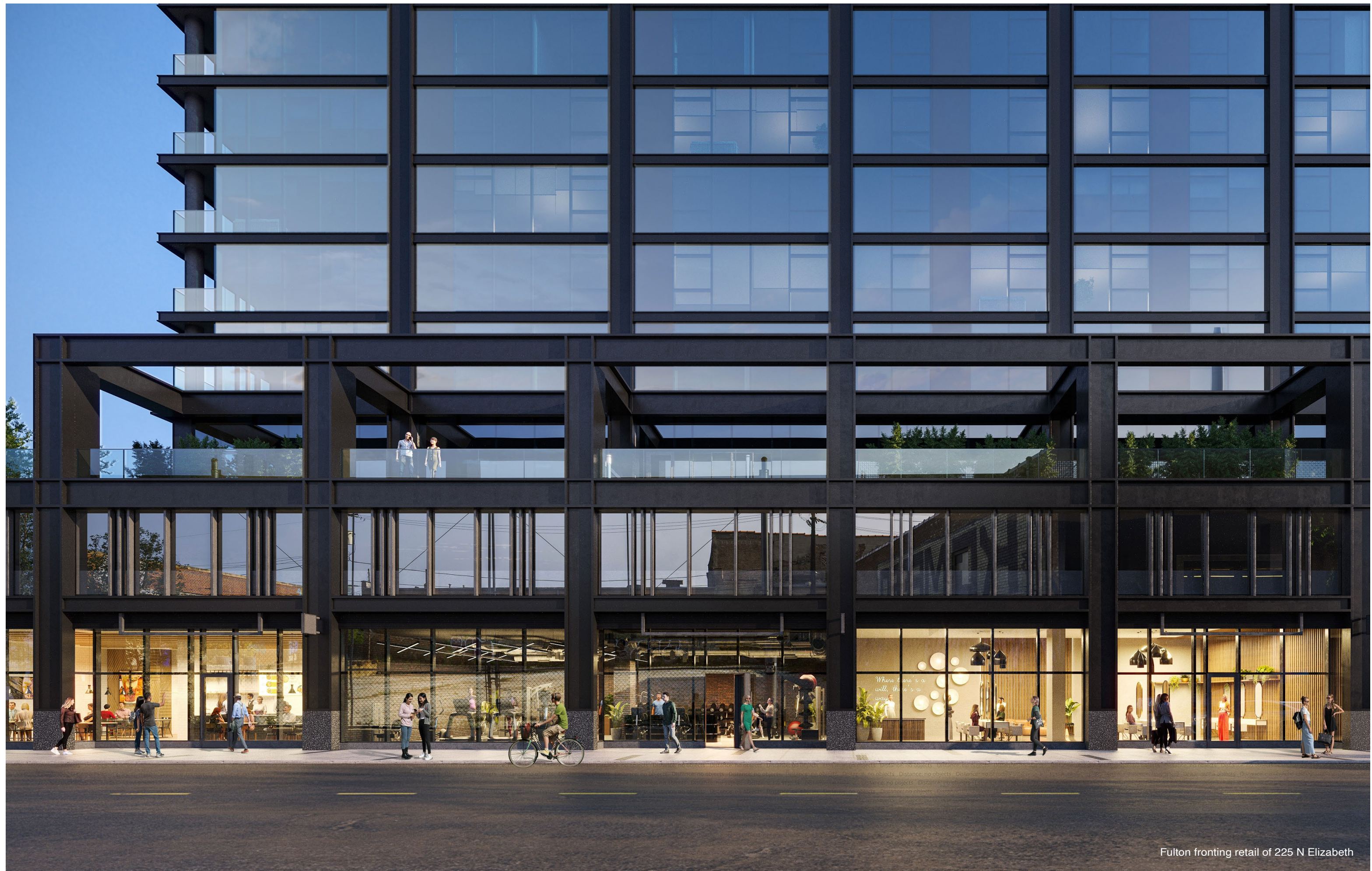
Fulton fronting retail of 225 N Elizabeth