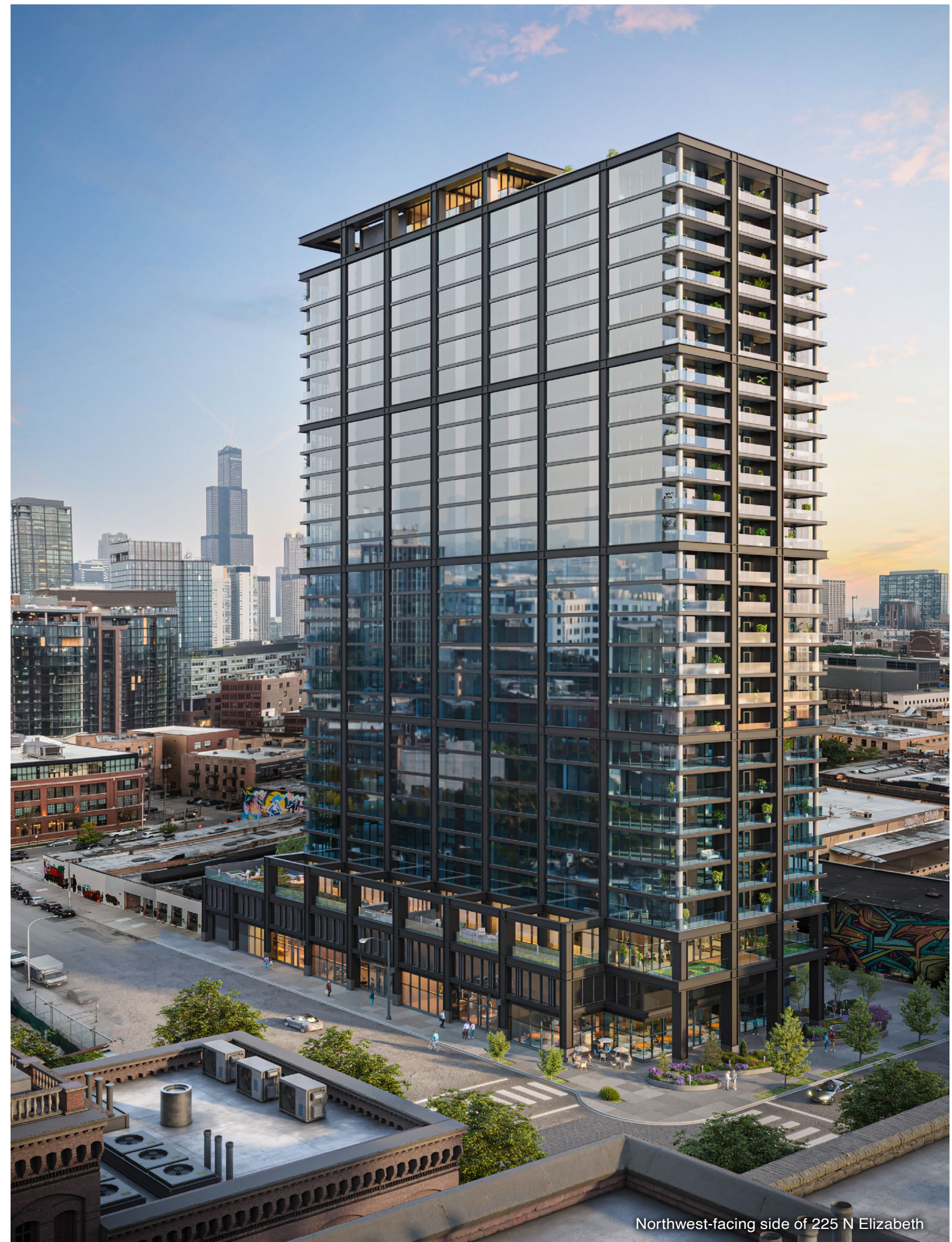
Northwest-facing side of 225 N Elizabeth