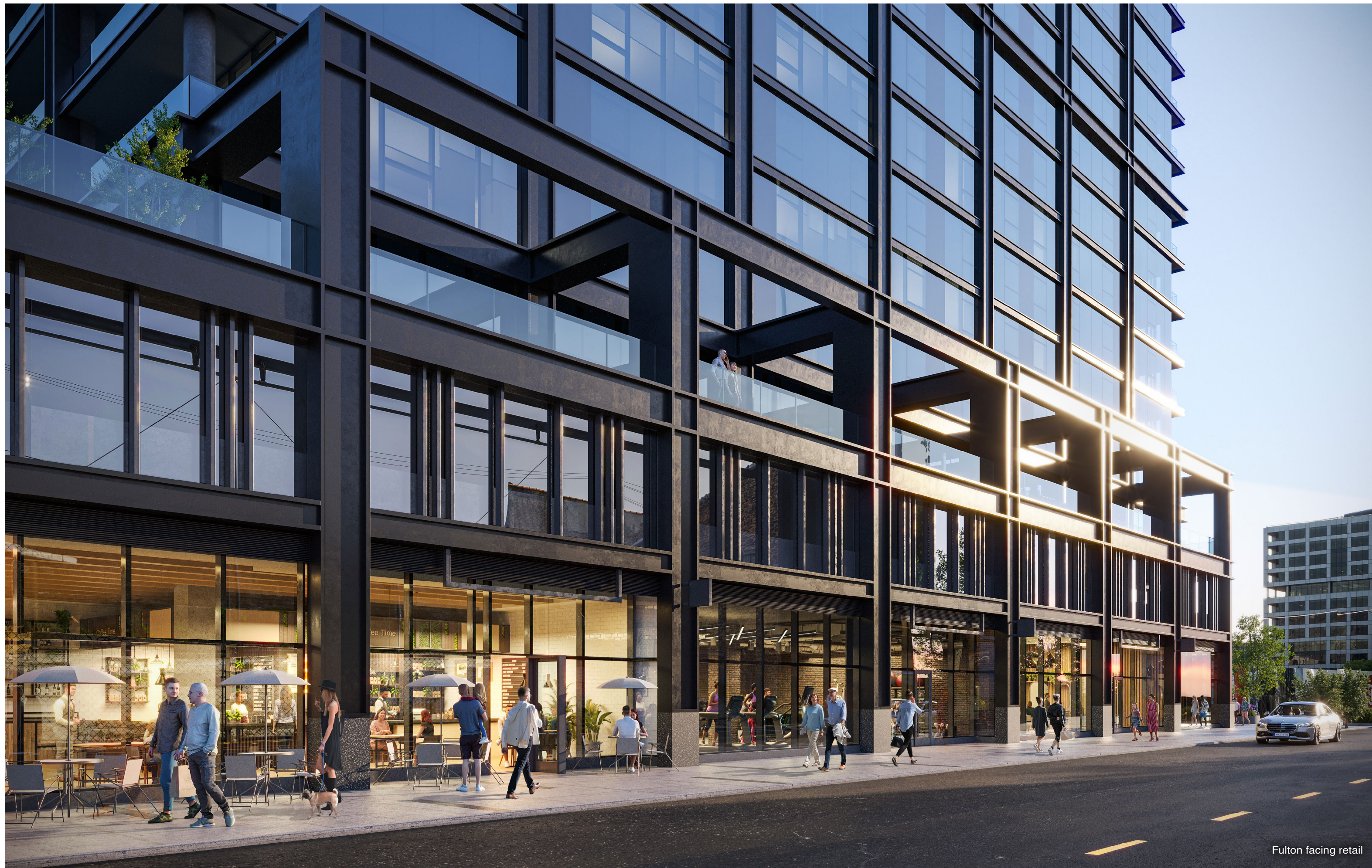
Fulton facing retail