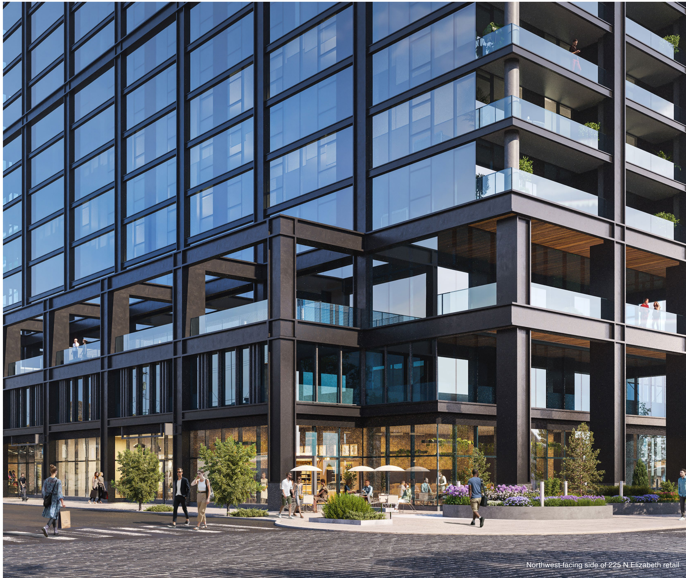
Northwest-facing side of 225 N Elizabeth retail